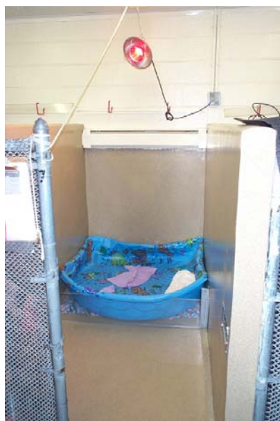
Fig 4: Photograph of a whelping "pool" with a heat lamp above.

Pups that get too cold will die, but pups that get overheated will not thrive either.