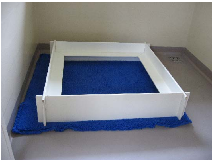
Fig 3: Photograph of a 'whelping box'. Note the "pig rails" around the edge to prevent crushing of pups.

Tip: A child's plastic swimming pool can make a good whelping box. Construction of a "pig rail" around the inside edge of the pool or box prevents pups from getting crushed. (See Fig 3)